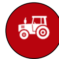
Min. 115 HP