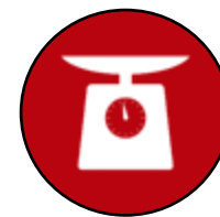
From 750 kg