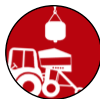
Hopper 850 l